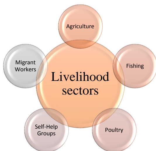
FIGURE 1 Different sectors being affected by the COVID-19 Pandemic

region as fish is an important part of their diet and lack of it can lead them to have nutritional deficiency. Women vendors also suffer from lockdown since there are only few boats for fishing and even if they purchase fish from landing centres, still they are not able to sell it because customers avoid buying it. Labourers engaged in this sector are not able to meet their family expenses, there are various people who migrated from Tamil Nadu to another states like Kerala and Karnataka but due to the lockdown, they had no option but to return to their homeland and going through financial crunch to meet their basic needs. There has been no export of fishes in this lockdown which has caused loss to many fish traders [6].